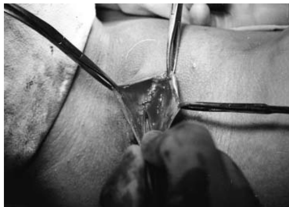
Figure 6 Full reconstruction of the clitoral area at operation.

mutilation or complication that involves the removal of the bulk produces defective sexuality, and for restoration of that sexuality the same bulk must be reformed surgically.