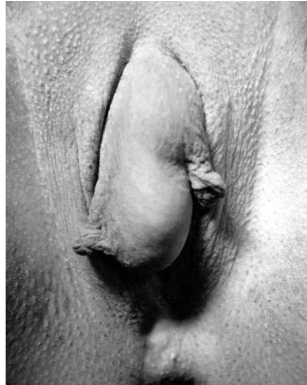
Figure 3 The clitoral stump cyst.

cysts were found to be significantly lowered for those treated by the simple surgical technique of excision (T/d.f.=30.04/52 and P < 0.0005 ) and were found to be nearly maintained to be insignificant from the mean score prior to surgery (T/d.f.=5.05.58 and P > 0.05 ) in those treated by excision and clitorolabial reconstruction (Table 3).