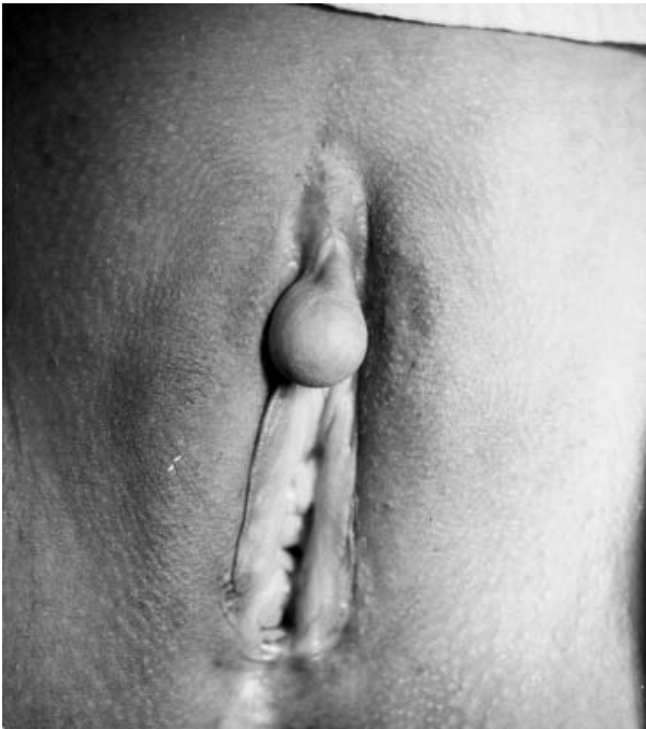
Figure 1 The frenular cyst.